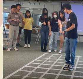
Welcome Day Camp 2023