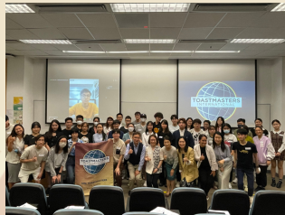
Joint Meeting with CCTMC, UCTMC, SMETMC (CUHK Shenzhen)