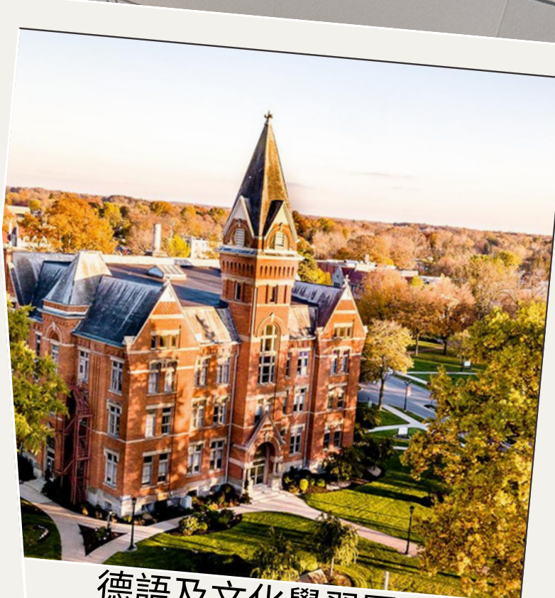
德語及文化學習團 International Summer School of German Language and Culture