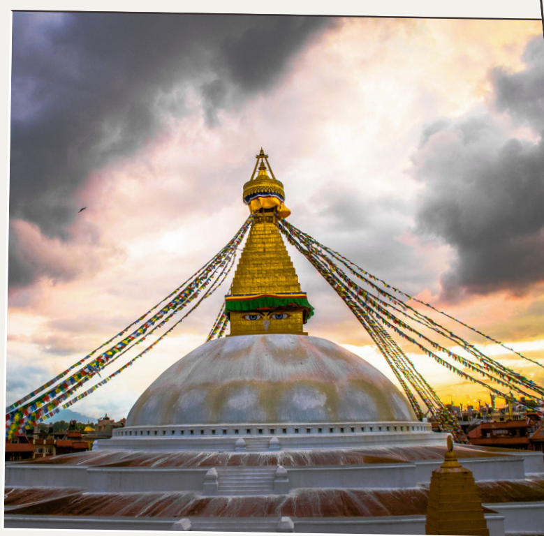
尼泊爾禪修之旅 Meditation Retreat in Nepal