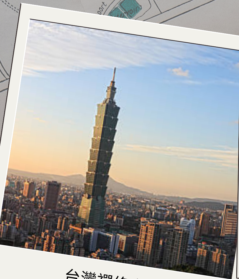
台灣禪修之旅 Meditation Retreat in Taiwan