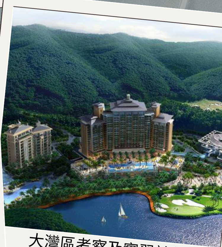
大灣區考察及實習計劃 Study and Internship Programme in Greater Bay Area