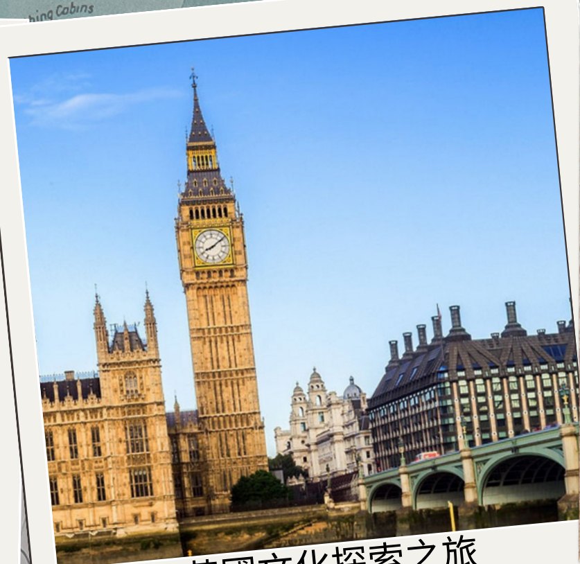
英國文化探索之旅 An Authentic English Journey Exploring the United Kingdom