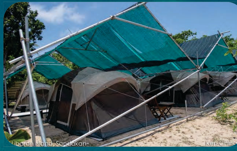
Selingan Island, Sandakan Ken Ching