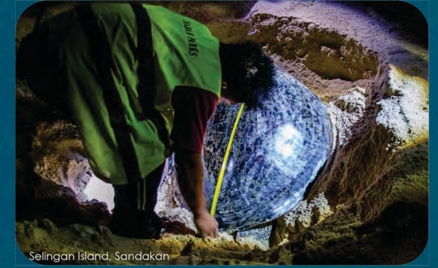
Selingan Island, Sandakan