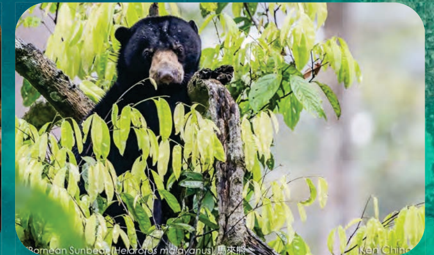
Bornean Sunbear ( Helarctos malayanus) 馬來熊