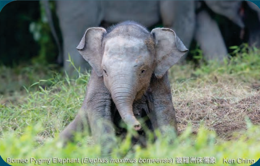
Borneo Pygmy Elephant ( Elephas maximus borneensis ) 婆羅洲侏儒象 Ken Ching