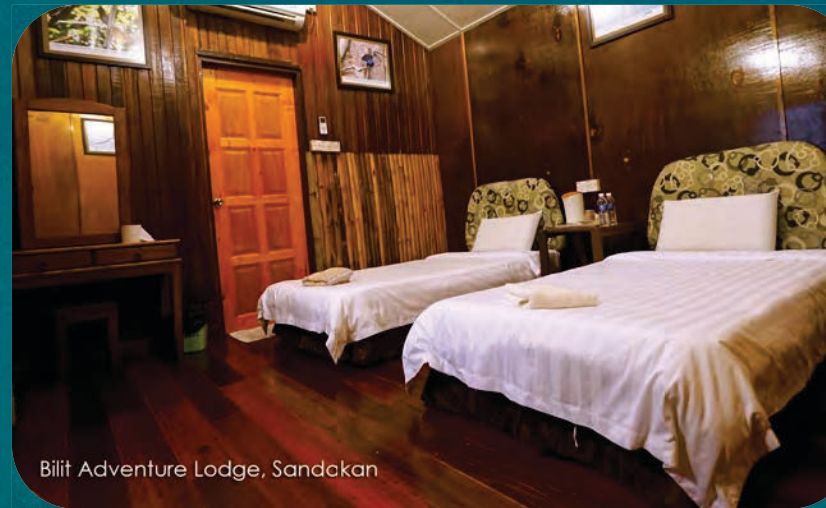
Biit Adventure Lodge, Sandakan