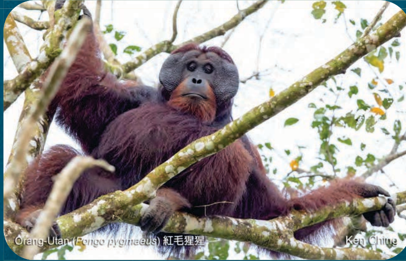
Orang-Utan ( Pongo pygmaeus) 紅毛猩猩