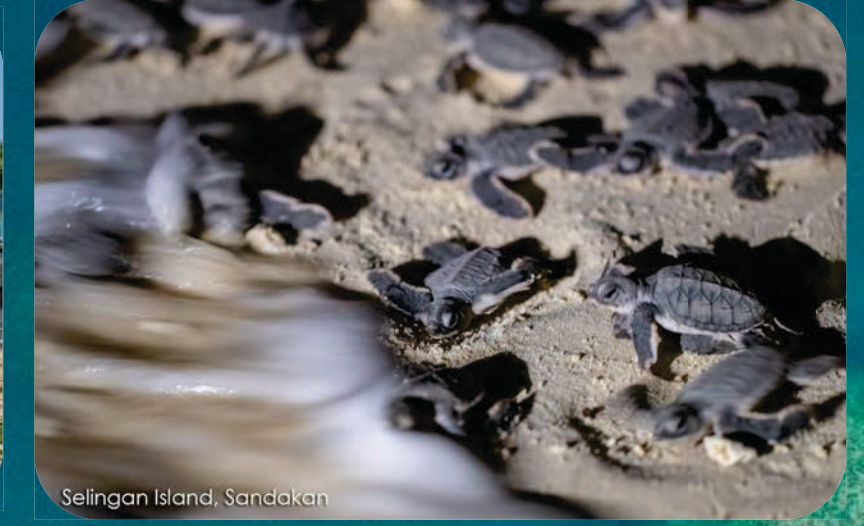
Selingan Island, Sandakan