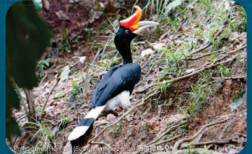
Rhinoceros Hornbill ( Buceros rhinoceros ) 馬來犀鳥 Ken Ching