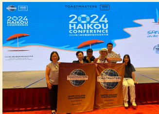
SCTMC and UCTMC members joining District 89 Haikou Conference