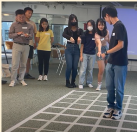
Welcome Day Camp 2023